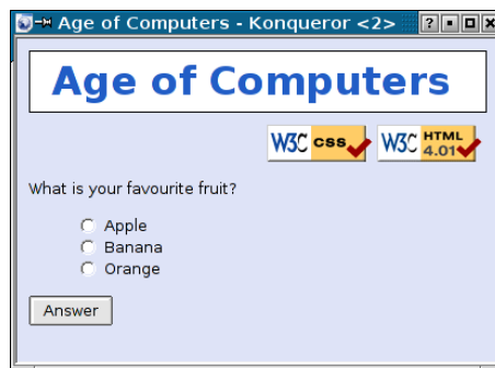
(b) Resulting HTML page for the same question.